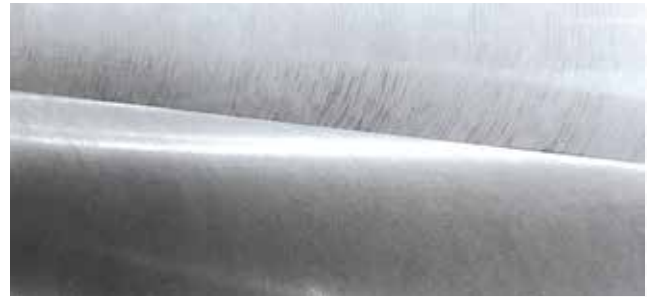
The milled stripes across the plate created by DME's state-of-the-art Fine-Milling technology. Surface Finish RA 90.